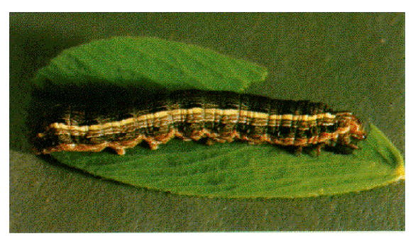
Western yellowstriped armyworm larva

This pest does not occur in damaging numbers every season. Young larvae may be found feeding on terminal leaves and buds during the day. Older larvae are usually found in trash on the soil surface. Larvae are most easily controlled when they are small and feeding on the upper plant foliage. Fields should be checked regularly during late May, June, and early July to detect small larvae. The presence of young larvae can be assessed with a sweep net, but sampling for older larvae should be done by looking