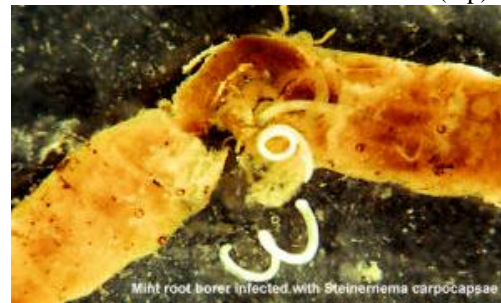
Mint root borer infected with nematodes