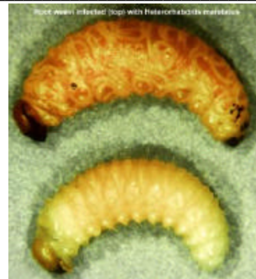
Root weevil infected with nematodes (top)

Entomopathogenic nematodes have several important attributes that make them excellent candidates for biological control of soil insects. 1) they are specialized to carry and introduce symbiotic bacteria into the insect hemocoel, 2) most have a broad host range that includes the majority of insect orders and families, 3) several species can be cultured artificially on a large scale, which makes it possible to commercially produce large quantities, and 4) they have limited impact on nontarget organisms and are not disruptive to the environment. Numerous insect pests on many different crops are controlled by parasitic nematodes. Insect hosts include