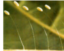
Green lacewing eggs