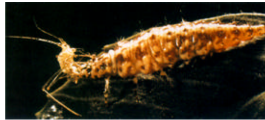
Green lacewing larva

Lacewings overwinter as pupae in protected areas such as cracks in the soil, under loose bark, and in trash. In warmer areas, adults may be present year around. Adults emerge in early spring and begin laying eggs almost immediately on plants infested with prey. A single female may lay as many as 30 eggs per day and several hundred during her lifetime. There are five or six overlapping generations each season.