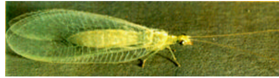
Green lacewing adult

Adults are green to yellow-green with four delicate transparent wings with many veins and crossveins. Adults are about 18 mm long with long hair-like antennae and red-gold eyes. Larvae are slender, mottled gray or yellow-gray and about 9.5 mm long. Larvae resemble lady beetle larvae but are flatter, smaller, and usually lighter colored. Larvae are referred to as aphid lions. Eggs are pale green, almost white, and are laid singly on long, slender stalks on plant foliage near prey. There are at least two species of green lacewing and one brown lacewing in the northwest.